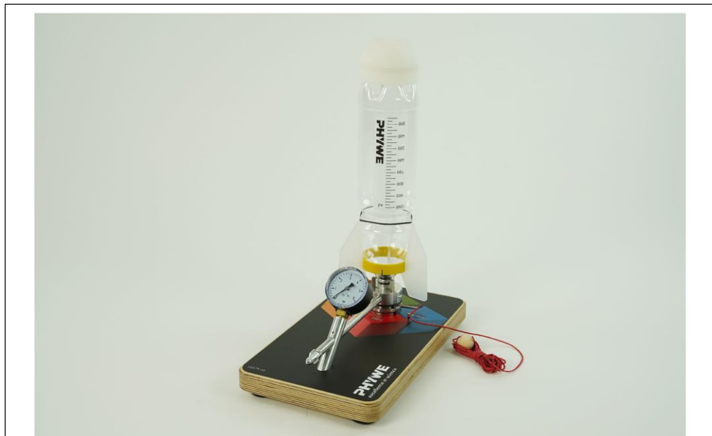
Fig. 1: Rocket model 02679-00