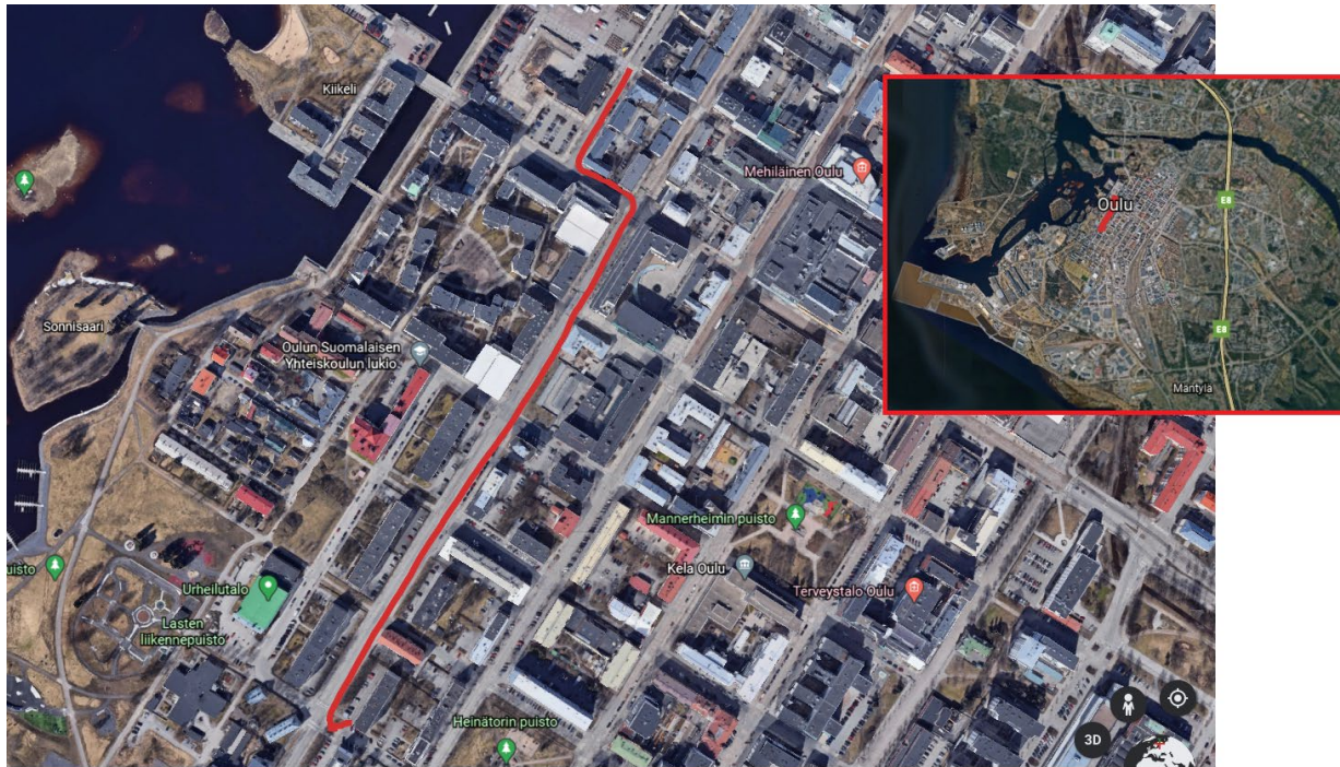
Figure 4. The test cases of S8709A Virtual Drive Test Toolset are based on live network measurements. (Google Maps, 2020).

Keysight can help network operators show case network segments, such as high-speed train, and benchmark success in real-world implementations. The S8709A Virtual Drive Test Toolset test enables operators to verify new devices prior to market launch and assure device and software interoperability with local network configurations. Real world implementations, that require high performance in an advanced propagation environment, set the first class of network operators. Customizable testing allows the network operators to develop their own test plans in co-operation with Keysight. As a result, network operators can validate real-life device performance with test plans that are based on field tests in their own networks.