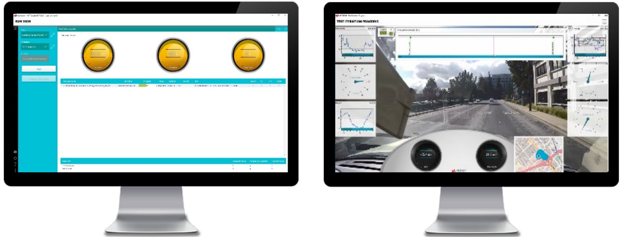
Figure 3. Keysight's S8709A Virtual Drive Test Toolset offers a single interface for test case execution, analysis and reporting

This enables device R&D teams to benchmark the performance of different builds and support network operator device acceptance testing with automatic reports and verdicts. Moreover, the S8709A Virtual Drive Test Toolset is highly customizable to fit different use cases and needs. Developers of prototypes can use the toolset to verify how well a device performs by stressing the design in demanding real-world conditions. Test conditions can be customized in the UXM 5G wireless test platform to support device performance development. It allows users to integrate real-world representation of networks around the globe as part of their lab automation framework to bridge the gap between lab and field testing with realistic performance test cases.