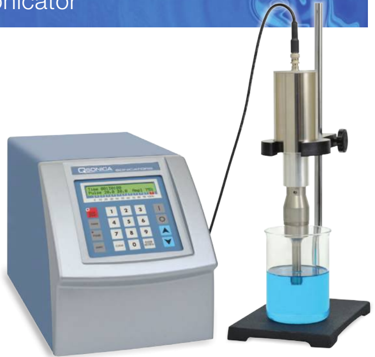
Stand sold separately.

Adjustable pulse On and Off times can be programmed from 1 second to 1 minute. Total programming has a maximum setting of 10 hours. A wide variety of probes and accessories are available to handle virtually any application.