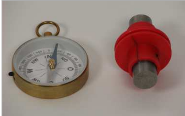
Fig. 1: Bar magnet and compass.

Examine the magnetic field around the bar magnet using the compass (Fig. 1). Make a sketch of the magnetic field in the report. (The compass needle always points along the magnetic field. Do you know why?)