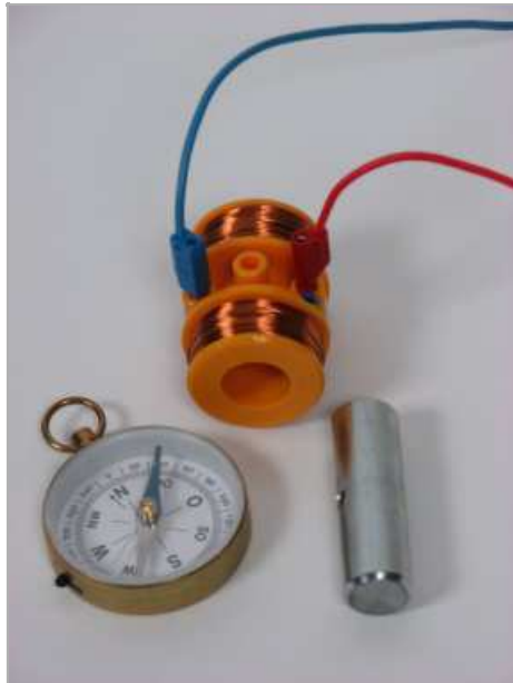
Fig. 3: Coil with iron core and compass.