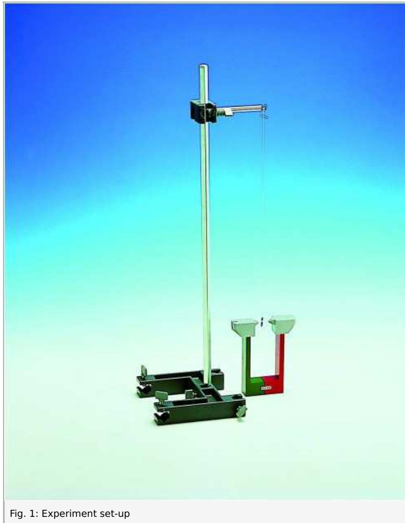
Fig. 1: Experiment set-up