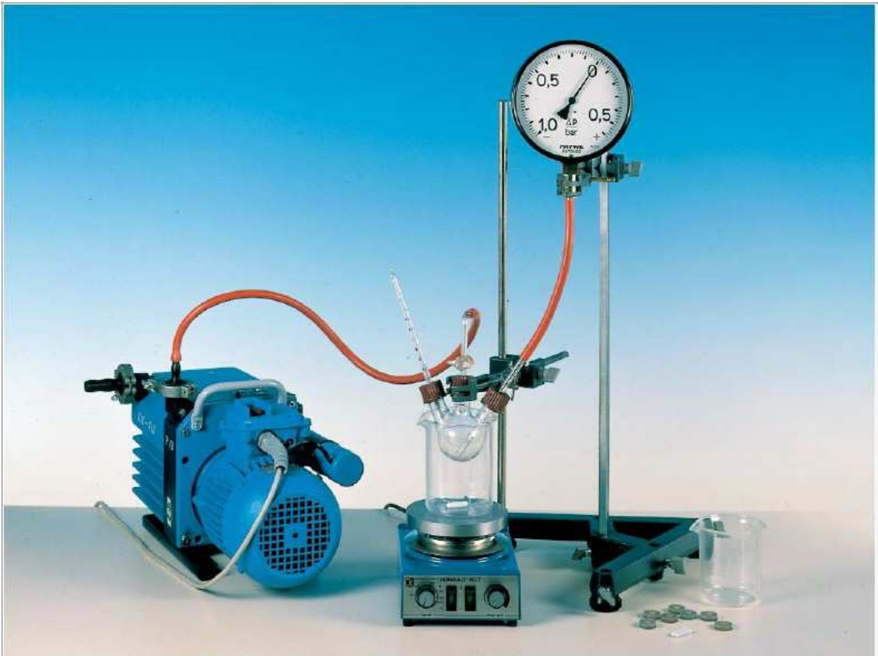
Fig. 1: Experimental set-up for measuring the vapour pressure of water below 100°C.