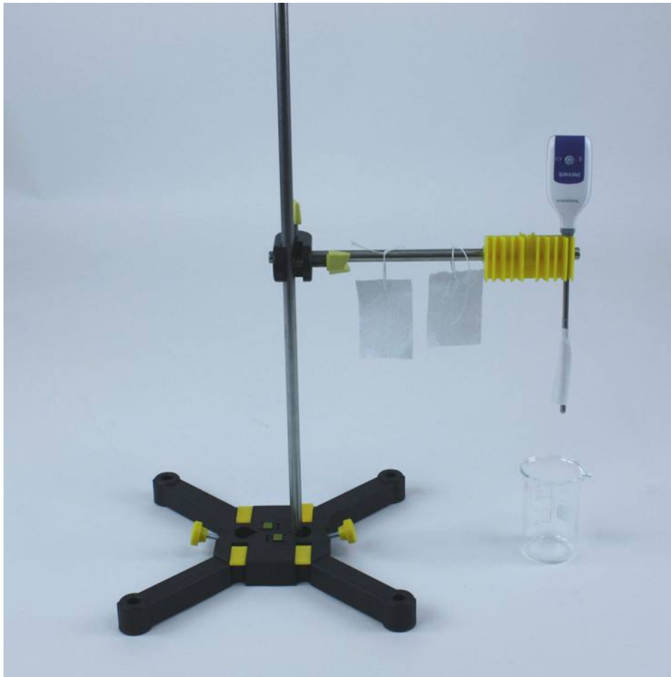
Fig. 1: Experimental set-up

Set-up the experiment as displayed in fig. 1.