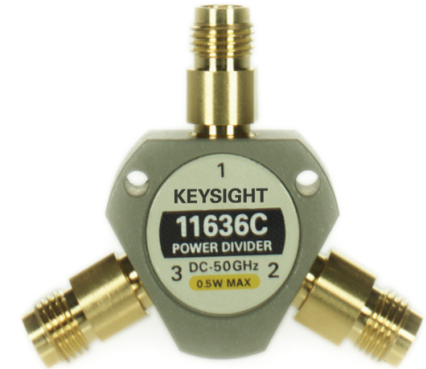
11636C power divider

The Keysight Technologies, Inc. power dividers are an RF and microwave accessory construct by equivalent resistance of 50 \Omega , it's used to divide power equally in a uniform transmission line for comparison measurements. The power divider provides a good impedance match at both the output arms when the input is terminated in the system characteristic impedance ( 50 \Omega ). Once a good source match has been achieved, the power divider may be used to divide the output into equal signals for comparison measurements.