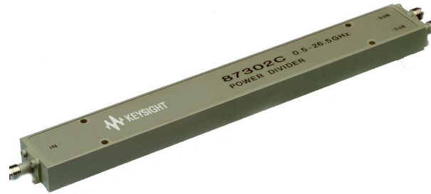
87302C Hybrid power dividers