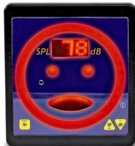
Fig. 2 Display with "frowning face"