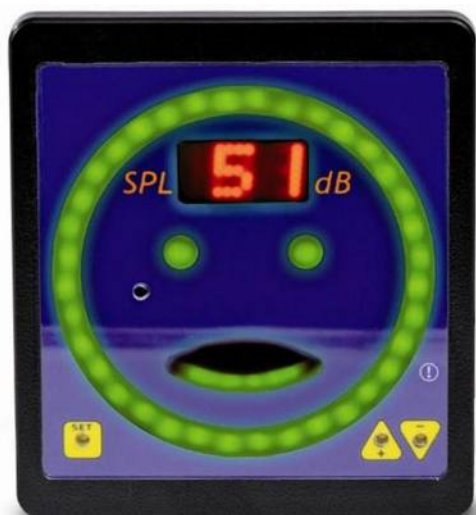
Fig. 1 Display with "happy smiling face"