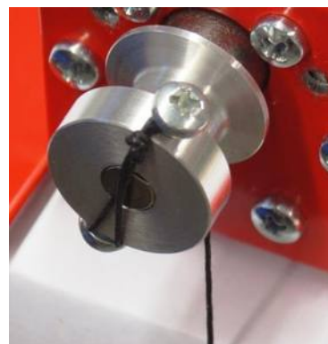
Fig. 1 Attachment of string