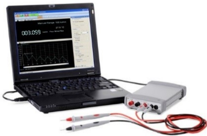
Figure 2. U2741A used as a standalone instrument