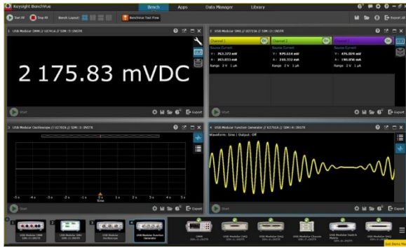
Figure 4. View measurements across USB DAQ, modular and bench instruments all on one BenchVue interface

The USB Modular Digital Multimeter App within BenchVue allows you to quickly configure and control the U2741A DMM to visualize measurements, perform data logging and annotate captured data. With BenchVue, you can display single measurement, charts or tables, from either a single U2741A DMM or multiple U2741A DMMs simultaneously to correlate trends you might otherwise miss. In just a few clicks, you can also record measurements and export results to popular PC-friendly applications such as Microsoft Excel and Microsoft Word for further analysis.