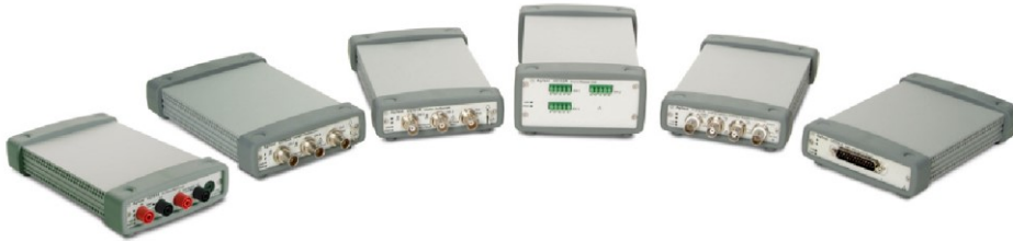
Figure 1. Keysight's USB Modular Instrument (MI) family

The next time you're called out to solve tough problems in electronic products or processes, leave the bulky transit cases behind. With Keysight Technologies, Inc.'s USB modular instrument (MI) family, you can easily carry powerful test gear in your bag along with your laptop PC. Our line of MIs includes two oscilloscopes, a DMM, a function generator with arbitrary waveform capability, a source/measure unit and a 4x8 switch matrix. All provide USB 2.0 connectivity (with USBTMC-USB488) standard and plug-and-play simplicity for easy use on the go or on the bench.