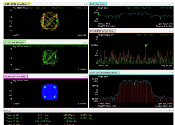
Analyze modulation types ranging from AM/FM/PM to QPSK (shown), 4096QAM and 18APSK.