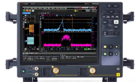
Keysight Infiniium UXR-Series 1 mm input models are available with 2 or 4 coherent channels