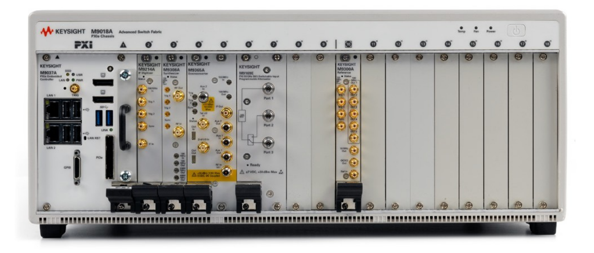
Figure 1. M9300A PXIe Frequency Reference inserted in slot 10, above, can be shared with four M9393A PXIe Vector Signal Analyzers in one chassis.