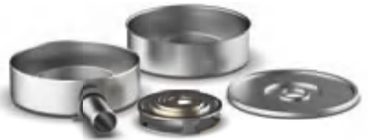
Collecting vessel with and without outlet, lid and labyrinth disk