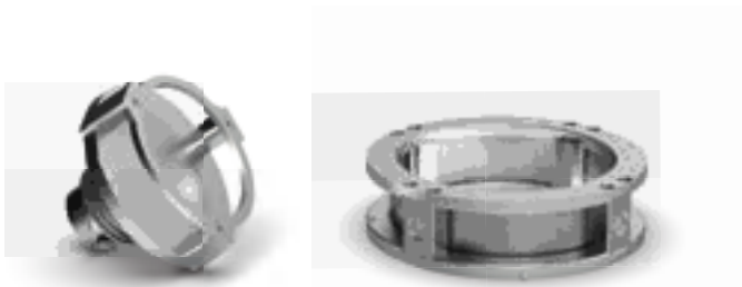
Cutting rotor with cooling fins and sieve shells holder with fixed knives and sieve shells

Samples which are difficult to grind or extremely temperature-sensitive (e.g. plastics) can be embrittled with the addition of liquid nitrogen and subsequently ground in the PULVERISETTE 14 premium line .