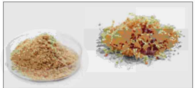
Medium-hard and fibrous materials like wood can be easily comminuted with the cutting rotor.