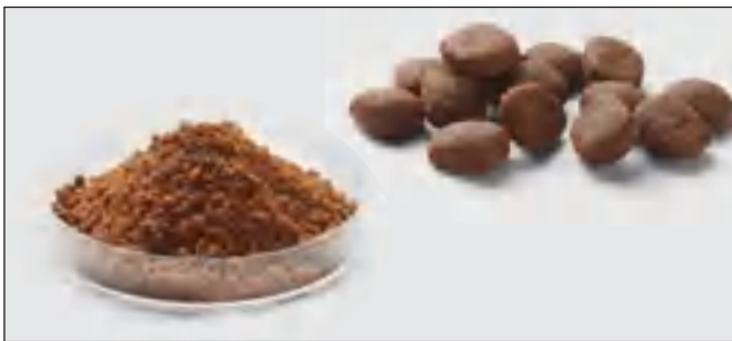
Very hard and fatty materials such as feed pellets can be easily comminuted with the impact rotor.