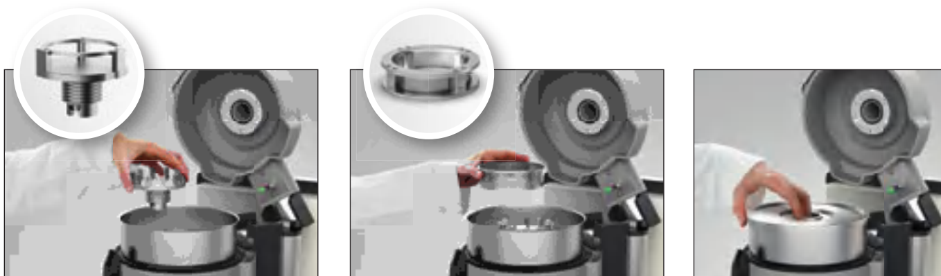
Absolutely safe operation due to Intelligence Safety Control System

As with all FRITSCH premium line instruments, the Variable Speed Rotor Mill PULVERISETTE 14 premium line makes your work even easier, faster and safer. This is especially due to the integrated Intelligence-Safety-Control-System, which only allows the machine to start once all safety-relevant parts are correctly inserted.