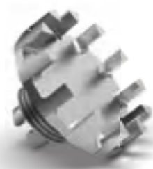
Impact rotor with cooling fins and sieve rings with reinforced edges

As a standard, the Variable Speed Rotor Mill PULVERISETTE 14 premium line is equipped with a funnel made of polyamide and stainless steel 316L and funnel lid. Order according to your task the suitable collecting vessel with or without outlet and lid with the corresponding labyrinth disk. This is the basic equipment needed for utilising the Variable Speed Rotor Mill or Cutting Mill. Depending on the application, you select an impact or cutting rotor and the matching sieve rings or sieve shells.