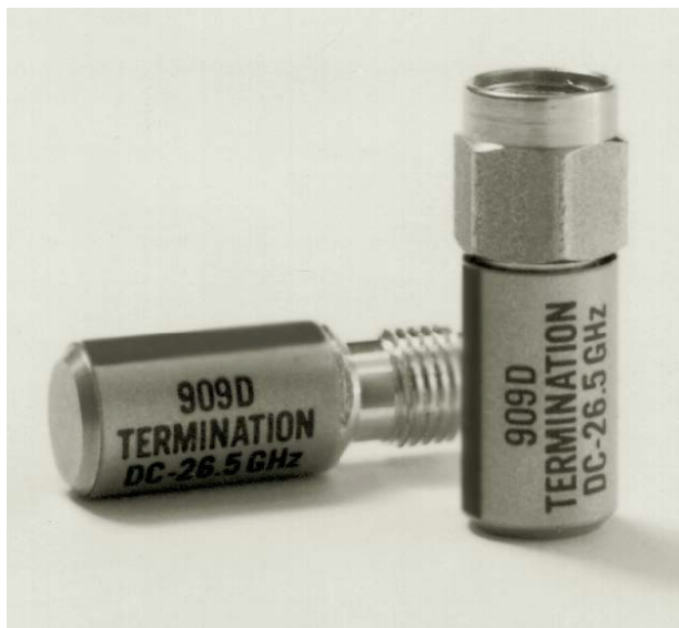
Figure 1-2 Keysight 909D coaxial terminations

The Keysight 909D has Precision 3.5 mm connector interfaces per IEEE standard 287 GPC.