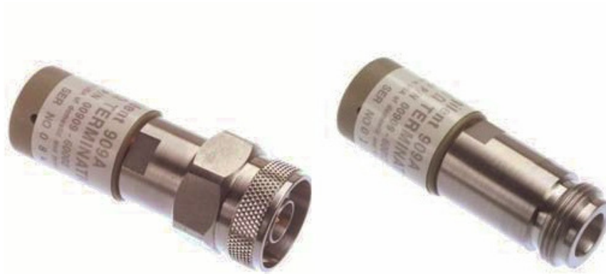
Figure 1-1 Keysight 909A with male and female Type-N connector

The Keysight 909A is furnished with a Precision 7 mm connector. This is a sexless connector with low RF leakage and clearly defined reference plane. As an option, the Keysight 909A can be furnished with either male or female Type-N connector interfaces per IEEE standard 287 GPC. The outer conductors of these Type-N interfaces are made of passivated stainless steel.