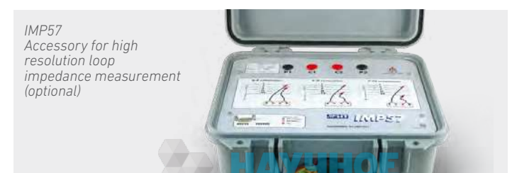
IMP57 Accessory for high resolution loop impedance measurement (optional)