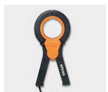
HT96U AC leakage current clamp (optional)