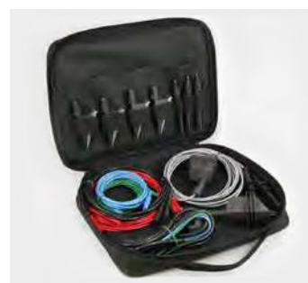
Carrying case for accessories (standard)