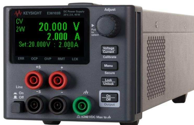
Option J01 recessed binding posts

Do you need to convert the power supply for different mains power? The two switches on the bottom of the instrument make it straightforward. See the product manual for details.