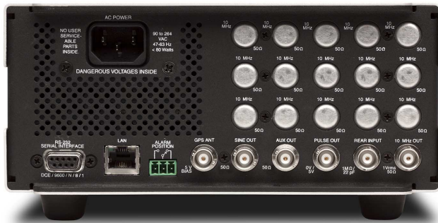
FS740 rear panel

Optional distribution amplifiers, each providing six additional rear-panel outputs for the 10 MHz, SINE, PULSE, AUX or IRIG-B outputs, can be installed. Up to three distribution amplifiers can be installed and configured from the front panel. Each output has its own driver which provides high isolation between outputs.