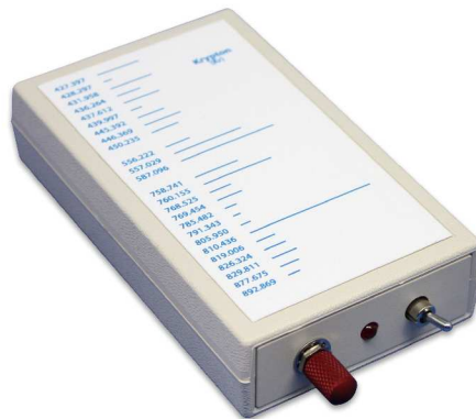
KR-1 Krypton Calibration Light Source

The following sections detail the features of the KR-1 Krypton Calibration Light Sources.