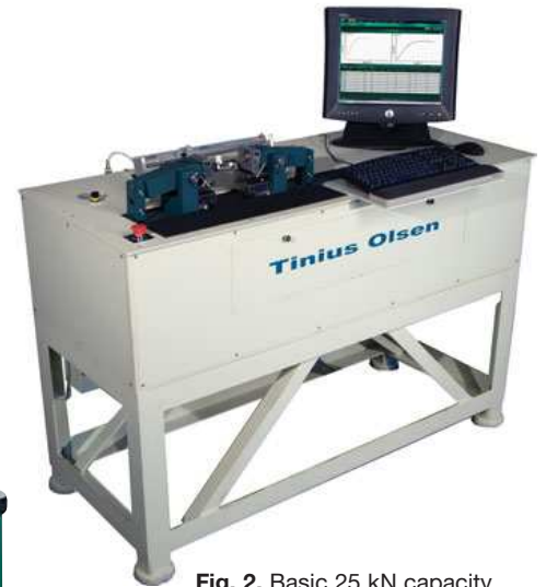
Fig. 2. Basic 25 kN capacity horizontal tensile testing machine, shown with optional extensometer

The operation of the basic machine is sophisticated, providing accurate and repeatable specimen placement against mechanical stops, automatic clamping, extensometer lowering