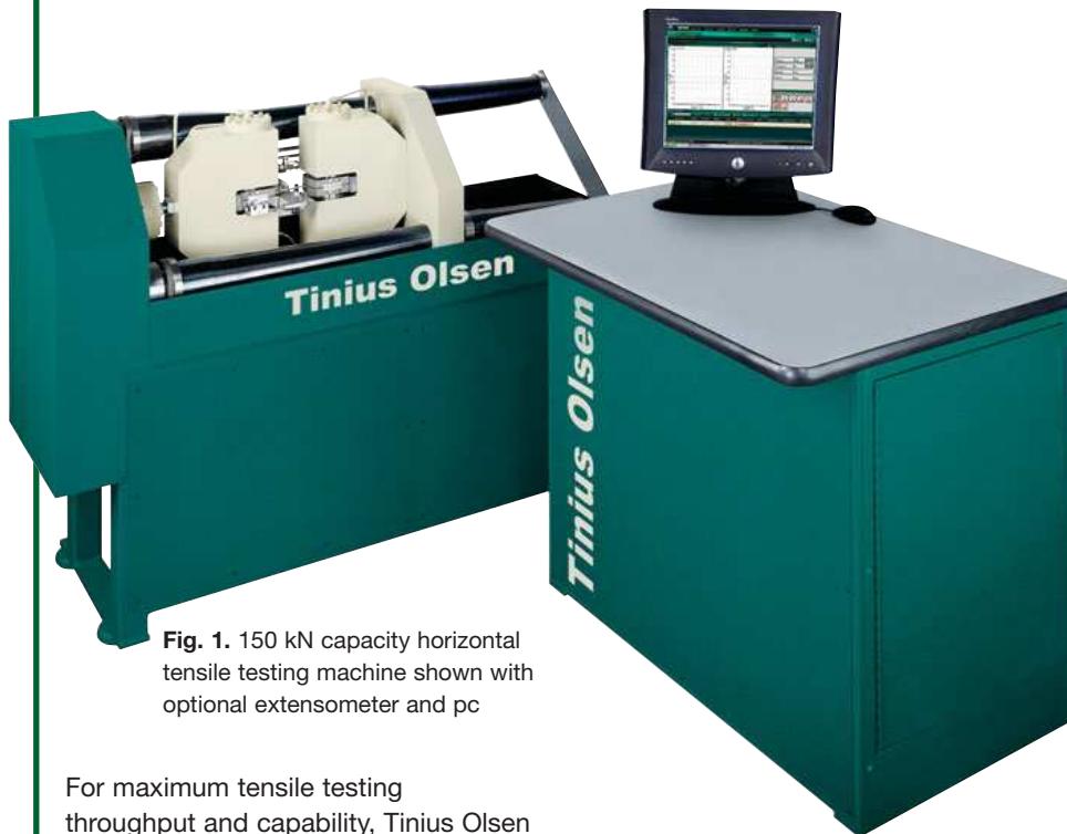
Fig. 1. 150 kN capacity horizontal tensile testing machine shown with optional extensometer and pc

For maximum tensile testing throughput and capability, Tinius Olsen offers a range of horizontal tensile testing machines in capacities of 5 kN (1,000 lbf), 25 kN (5,000 lbf), 150 kN (30,000 lbf) and 300 kN (60,000 lbf).