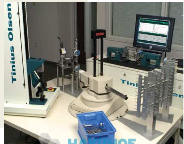
Fig. 6. Detail showing the pick-and-place robot, sample racks, laser barcode reader, and sample dimension measuring station, broken sample bin, and another test station. This second test station could be a flexure test, a hardness test, or another kind of physical test

Notes: 1. Load weighing system meets or exceeds the requirements of the following standards: ASTM E4, EN 10002-2, BS 1610, DIN 51221, ISO 7500-1. Tinius Olsen recommends that systems are verified at installation in accordance with ASTM E4 and ISO 75001. 2. Alternate, lower capacity load measurement cells can be supplied for these frame capacities. 3. Strain measurement system meets or exceeds the requirements of the following standards: ASTM E83, EN 10002-4, BS 3846 or ISO 9513. 4. Specifications are subject to change without notice