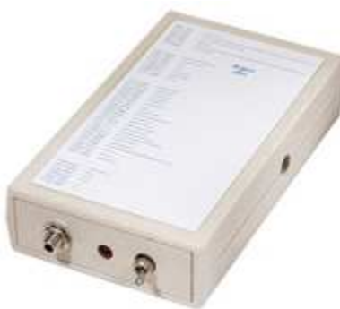
AR-1 Argon Calibration Light Source

The following sections detail the features of the AR-1 Argon Calibration Light Sources.