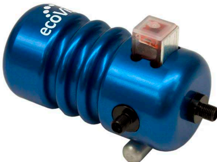
ecoVis Light Source

EcoVis is designed for absorbance and fluorescence of cuvette-based samples. Its rugged housing and simple design make it useful for teaching labs and setups where basic absorbance and fluorescence measurements are performed routinely.