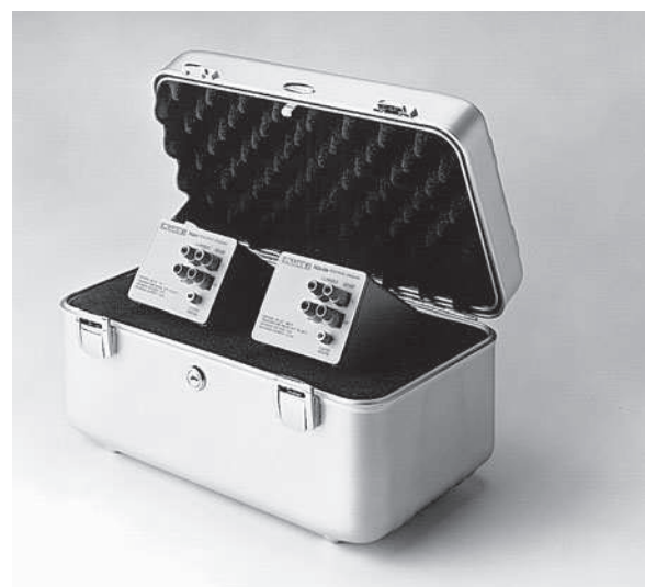
Optional 742A-7002 transit case

Fluke. Keeping your world up and running.