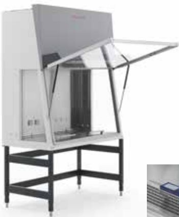
Smart Clean Plus hinged front window

Adjustable ergonomic armrests are provided with each unit to assure proper arm support to reduce strain during prolonged work periods while extending reach within the cabinet. Removable gel filled comfort pads are available as an option to enhance the user experience.