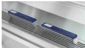
Removable gel-filled comfort pads