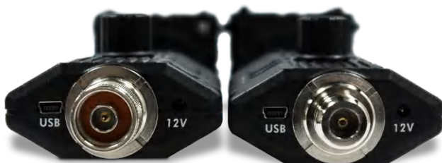
RF Connectors N Male and N Female