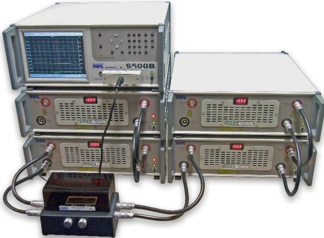
Typical 120 MHz 40 A DC Bias Current System (using 65120B, 4 x 6565-120 and 1027 Fixture)