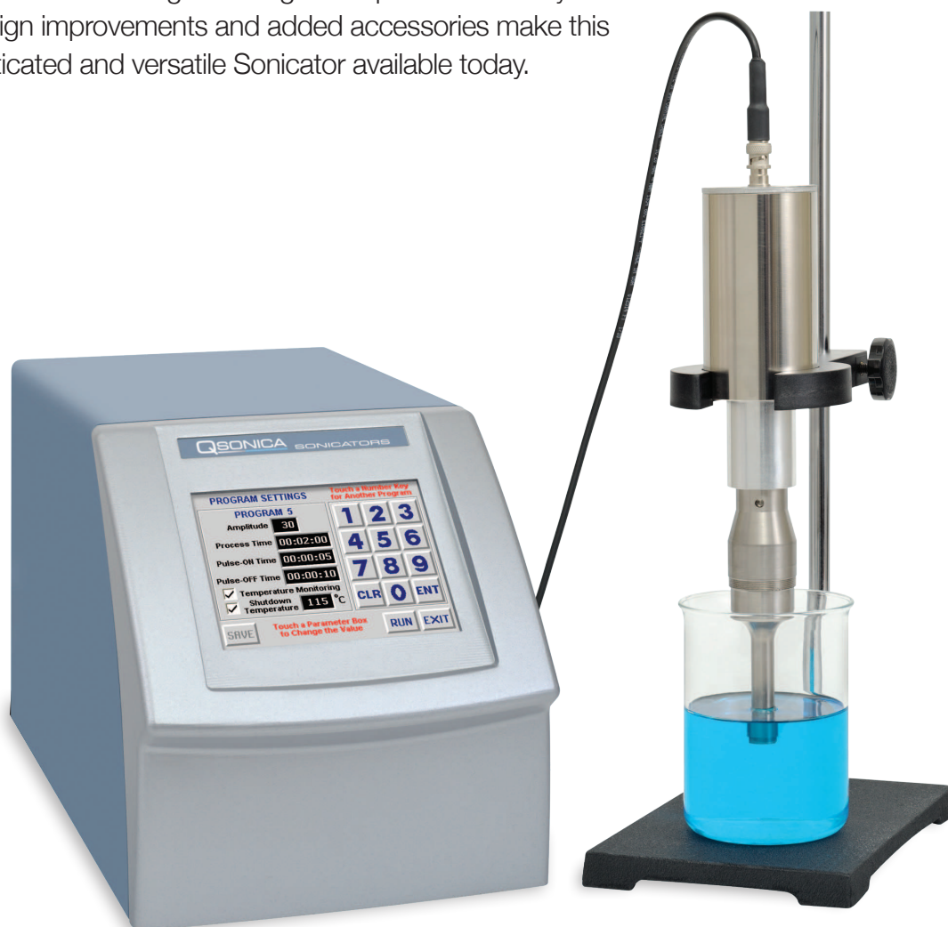
Stand sold separately.

The Q700 is the only sonicator on the market that offers full amplitude control from 1-100%. This enables greater control of the probe's intensity, helping to pinpoint the optimum settings for efficient sample processing. We have increased maximum power output to 700 watts making the system more durable and capable of handling even larger samples if necessary. Our new display, design improvements and added accessories make this the most sophisticated and versatile Sonicator available today.